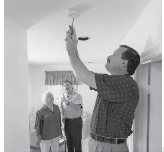
Firefighters and community volunteers assist the Burn Institute with installing FREE smoke alarms.