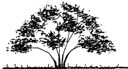
Chaparral Plant After Pruning

Step 4: Dispose.... of the cuttings and dead wood by either hauling it to a landfill; or, by chipping/mulching it on-site and spreading it out in the Zone 2 area to a depth of not more than 6 inches.