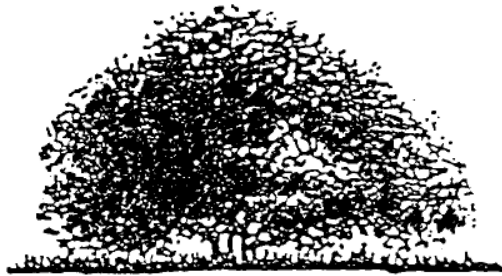
Chaparral Plant Before Pruning

Remaining plants, 4-ft or more in height, should then be cut and shaped into “umbrellas.” This means pruning one half of the lower branches to create umbrella-shaped canopies. This allows you to see and deal with what is growing underneath. Upper branches may then be shortened to reduce fuel load as long as the canopy is left intact. This keeps the plant healthy, and the shade from the plant canopy reduces weed and plant growth underneath. Vegetation that is under 4 feet in height, like coastal sage scrub, should be cut back to within 12 inches of the root crown.