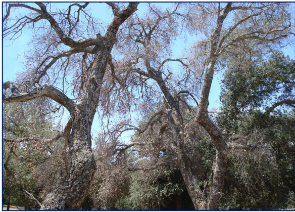
Mature dead oak trees infected with GSOB in Descanso

This program is part of a collaborative effort between the RCD and numerous state and federal agencies to help reduce fire fuels and stop the spread of a devastating GSOB pest invasion to the area’s native oak trees.