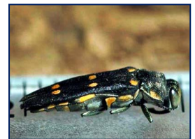
Please see the reverse side of this page for more detailed information about the GSOB.

This is a NO COST service for property owners and offered only in specified areas of San Diego County as determined by the RCD in cooperation with F.A.S.T. Funding for this program is limited and requests for participation will be prioritized according to the level of risk from tree mortality within the geographic location.