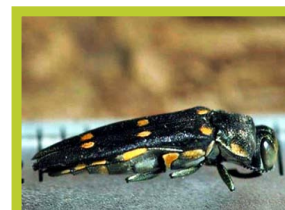
Above Top: D-shaped exit holes created by the GSOB on the outer bark of the tree. Lower Left: GSOB larvae – approx. 2 cm in length. Lower Right: GSOB adults – approx. 1 cm in length with six orange spots on the wings.